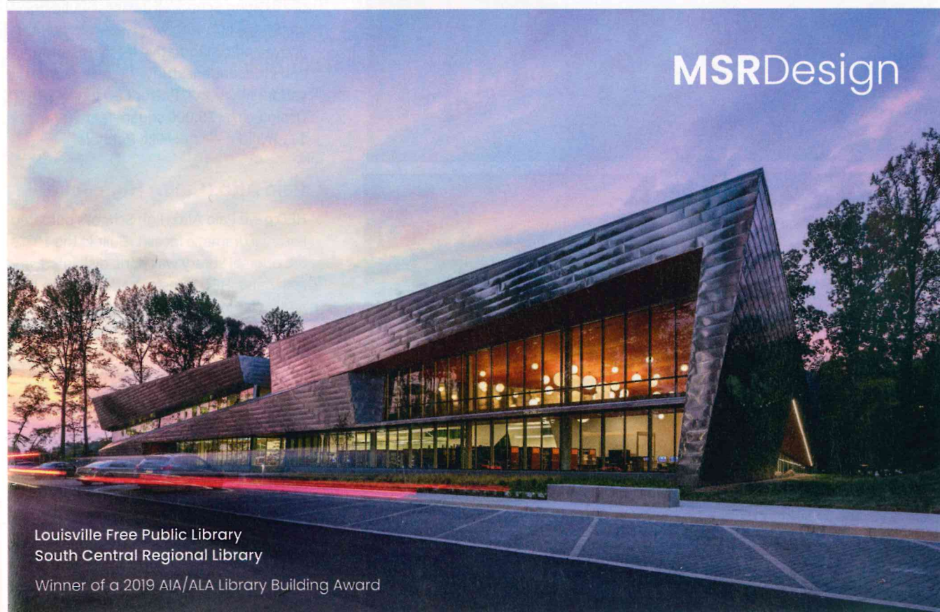
Louisville Free Public Library South Central Regional Library

Vellore Village Library is an addition to the Vellore Village Joint-Use Complex, which also houses a community center, secondary school, and 35-acre park. The library meshes with the existing building's design, yet stands out with curvilinear and cantilevered features, including an exterior reading terrace that overlooks a skate park. PROJECT: New construction ARCHITECT: ZAS Architects SIZE: 8,500 square feet COST: $4.5 million Canadian